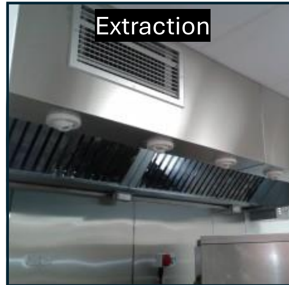
Commercial Extraction Canopies