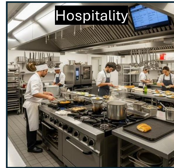
Kitchens for Restaurants, Pubs, Hotels and Guest Houses