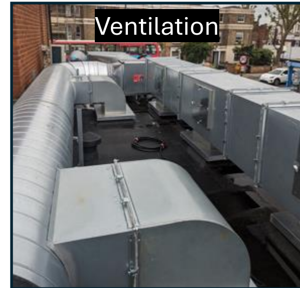
Full HVAC Services (Heating, Ventilation & Air Conditioning)