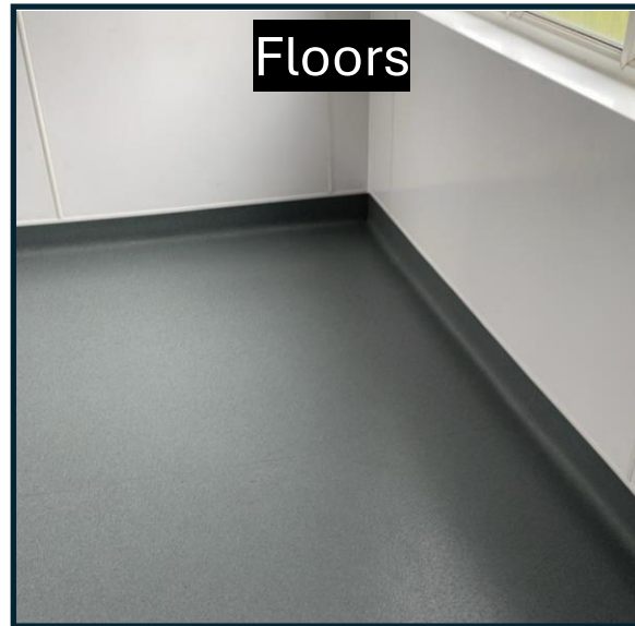
Coved Anti-Slip Safety Flooring