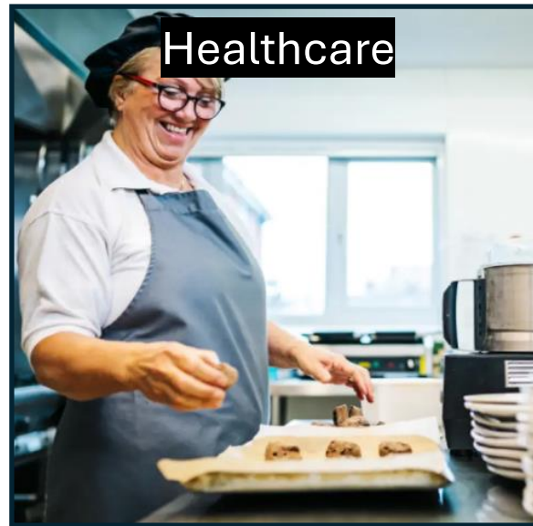
Care Home and Hospital Kitchens