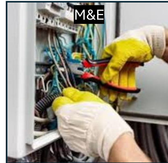
Gas Interlock, Odour Control & Fire Suppression Systems