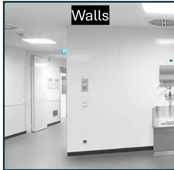
Hygienic UPVC or Stainless-Steel Wall Cladding