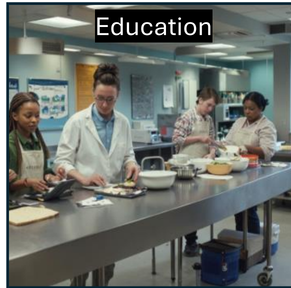
Nurseries, Schools, Colleges, and University Kitchens