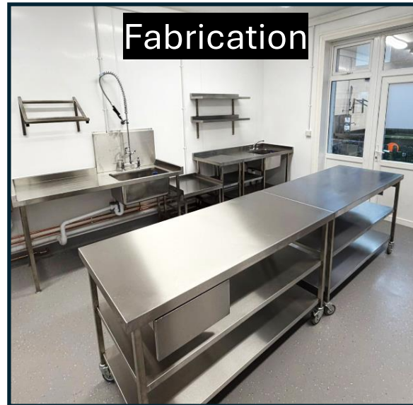
Made-To-Measure Stainless Steel Fabricated Units & Appliances